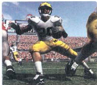
PASS IT ON: NCAA Football 06

FOR MANY SPORTS FANS the end of summer means just one thing: football! If you want to do more than watch, you can get in on the gridiron action with two new videogames. Madden NFL 2006 ($49.95 for Xbox, PlaySta-