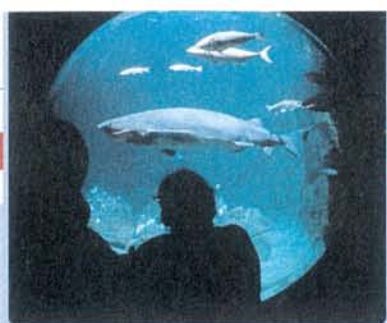
BIG FISH: At the Monterey Bay Aquarium

If you want to take a dip in the sea without getting wet this summer, how about a trip to a nearby aquarium? Here are the top picks from Zagat Survey's U.S. Family Travel Guide. (You can leave your underwater camera at home.)